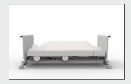
Minimum bed height of 32cm reduces falls risk

Round Table Top made of oak laminate 30cm diameter Height adjustable and swivels