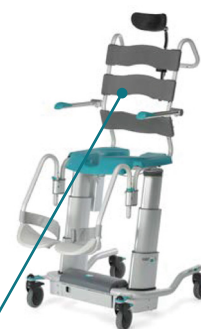
EASY SoftBack Flexi

EASY has a neck support that is adjustable in height and from side to side for comfortable support and individual fit.