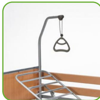
MEDLEY ETUDE PLUS SELF HELP POLE