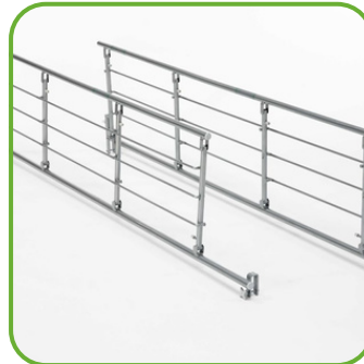
MEDLEY SCALA 3/4 METAL SIDE RAIL - PAIR