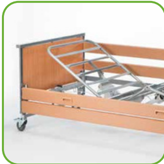
MEDLEY BELLA FULL LENGTH WOOD SIDE RAIL - PAIR