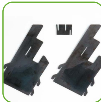
MEDLEY BED TRANSPORT BRACKETS