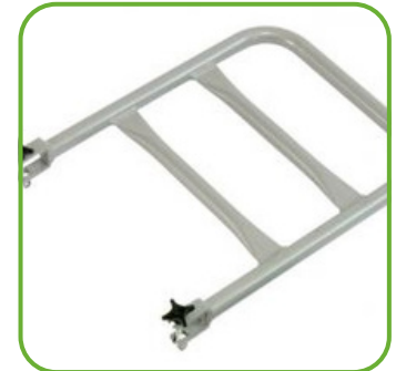
MEDLEY SIDE RAIL SUPPORT HANDLE 40X50CM